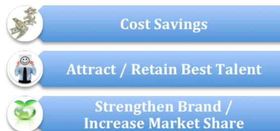
FIGURE 1: BUSINESS CASE FOR GREEN TEAMS

The National Environmental Education Foundation’s (NEEF) recent report The Engaged Organization: Corporate Employee Environmental Education Survey and Case Study Findings stresses, “By engaging employees, companies can spark innovative changes in everyday business processes that save money and reduce environmental and social impacts while also inspiring employees to make sustainable choices at home and in their communities.”